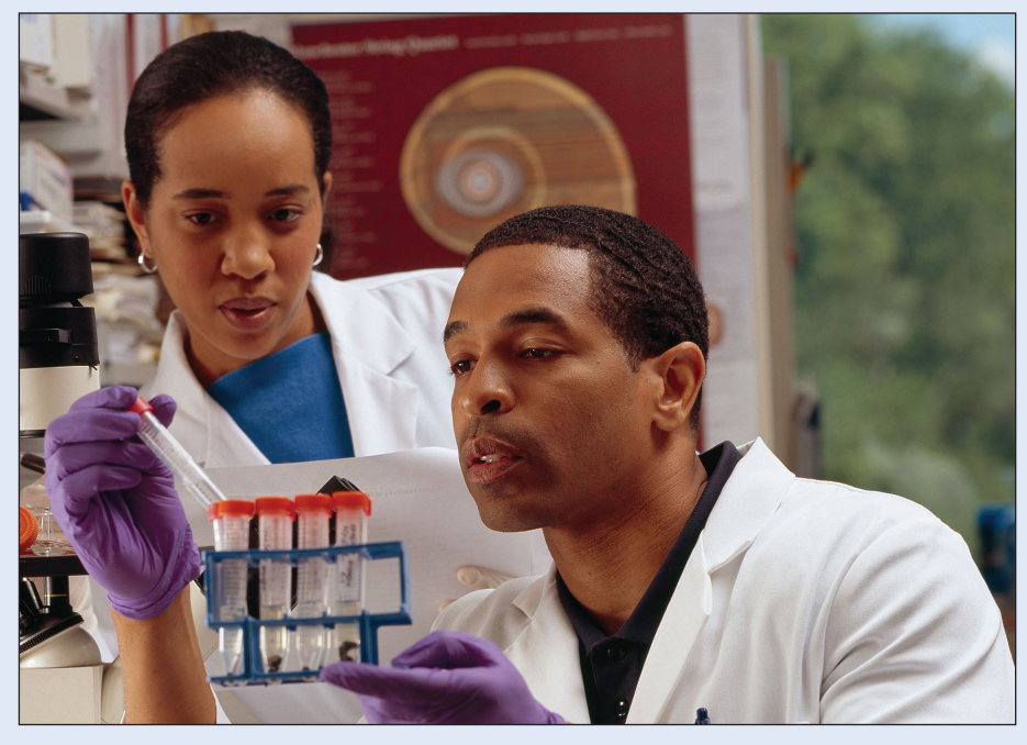
DTP sends samples to investigators at labs all over the world

chemical sample are known, the description includes links to PubChem Compound.