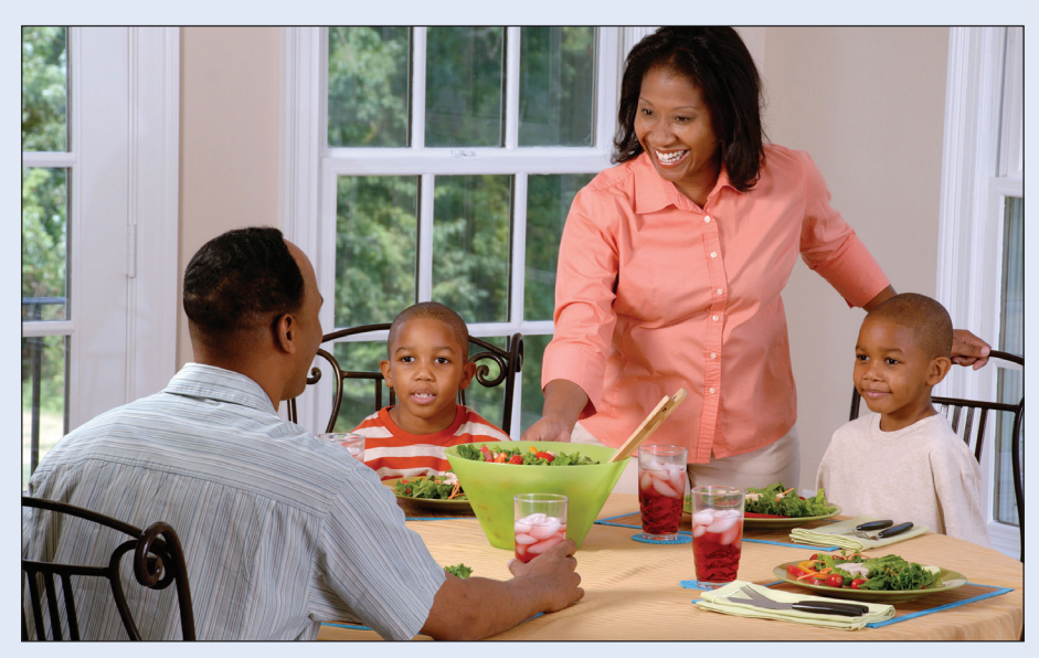
PA-09-130 invites applications on nutrition research

Refine current theoretical mechanisms of behavior change as well as focus on developing new models to examine and explain key factors that specifically influence diet and physical activity behaviors.